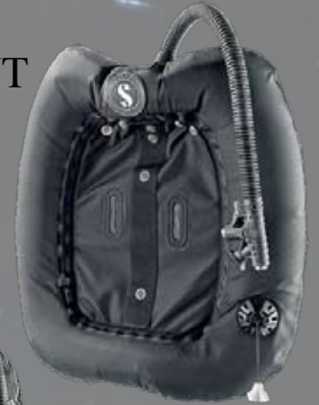
HS TWIN WING